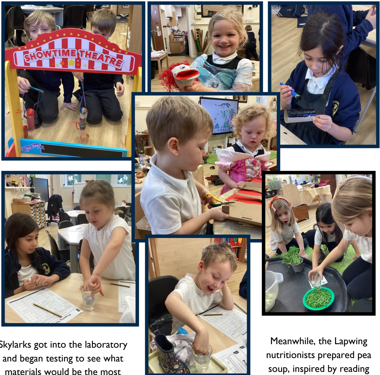
Skylarks got into the laboratory and began testing to see what materials would be the most suitable to make a tent.

Both classes then used their puppets to re-enact the stories.